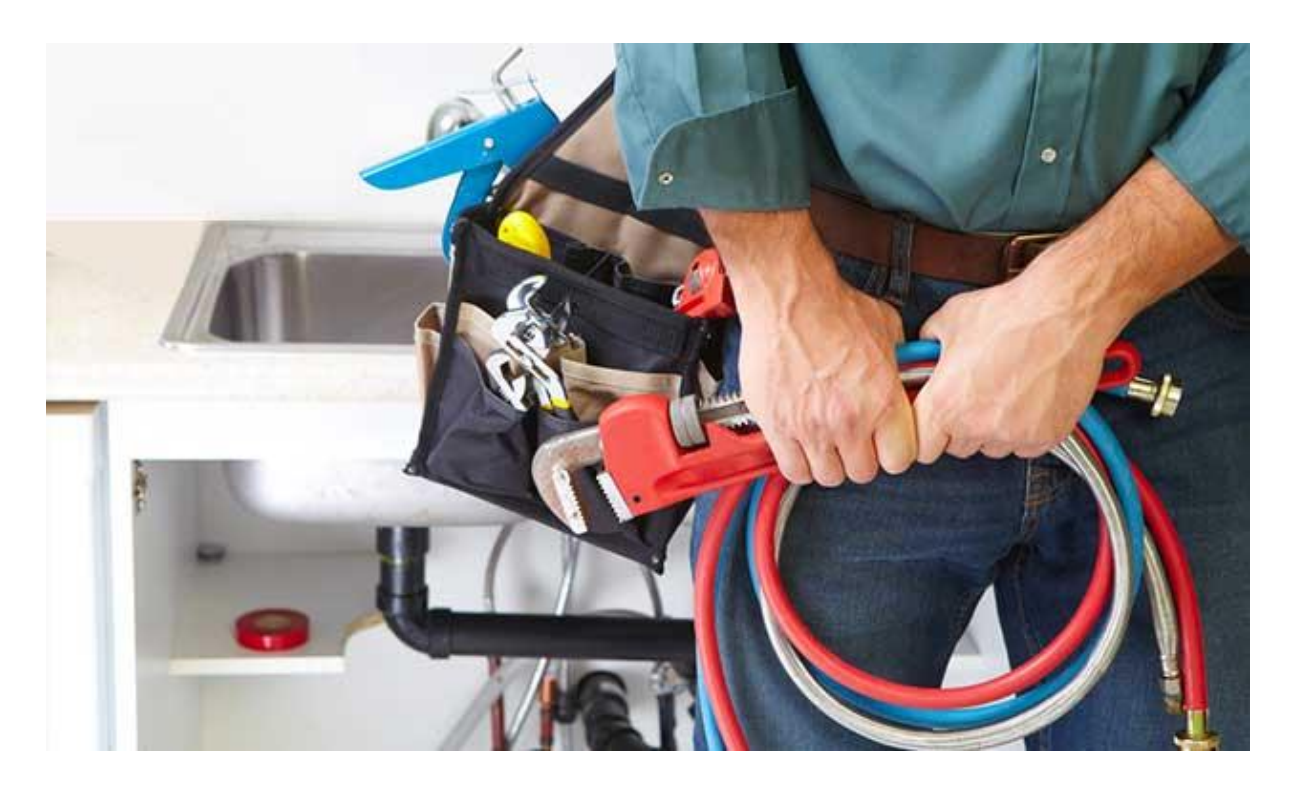
Giving expert opinions on house plumbing

If you rent a professional plumber to handle issues, you can also ask him to have a look at the plumbing system in your own home. The plumber will be capable of establish whether a particular aspect of the plumbing can pose issues sooner or later and what steps Wikipedia Here can be taken to stop it. This may be particularly helpful if the plumbing in your own home is sort of old. The skilled plumber will have the ability to give you professional opinions on which components of the plumbing are intact and which must be modified.