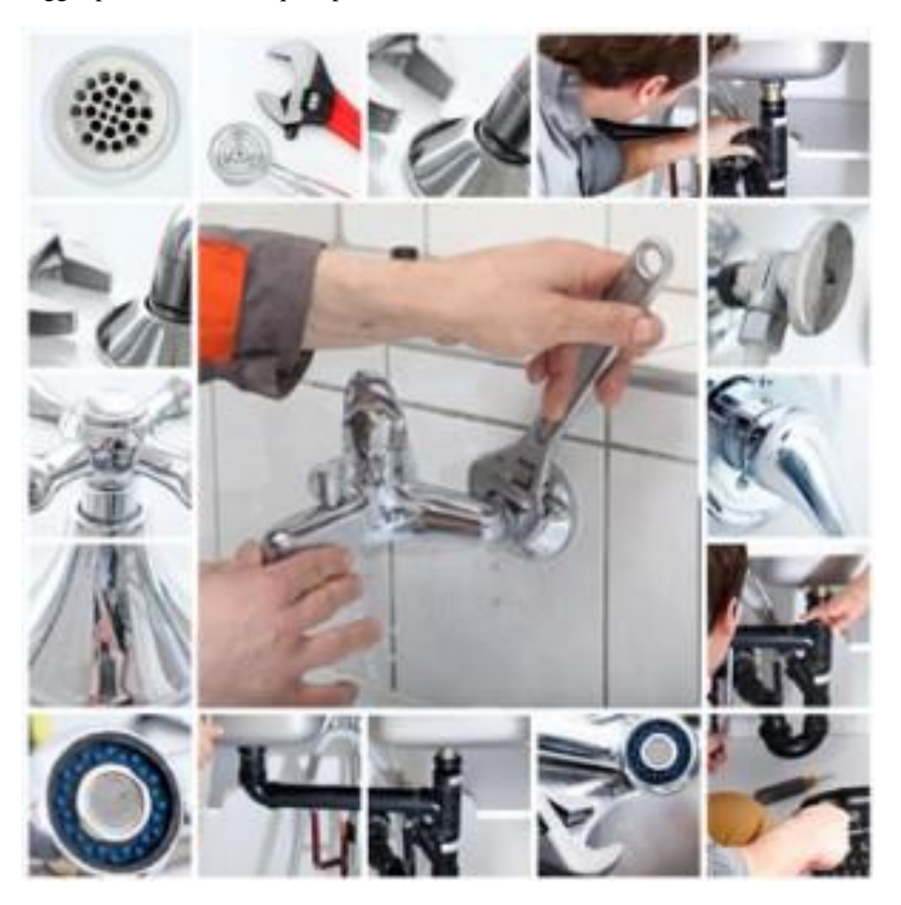
The importance and benefits of hiring plumbing providers

one of many indispensable components that we use frequently every day even without realising it. Much like different systems, the water provide system can even start to trigger points and will require preservation services.