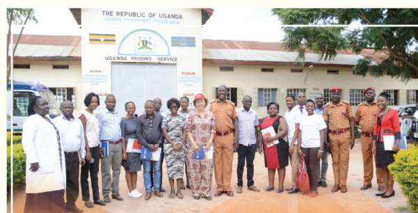
The Uganda CCM team during a site visit in the West Nile region.

The visits are carried out to help understand the extent to which grant resources are reaching intended beneficiaries and identify any bottlenecks in the implementation processes for key programme interventions