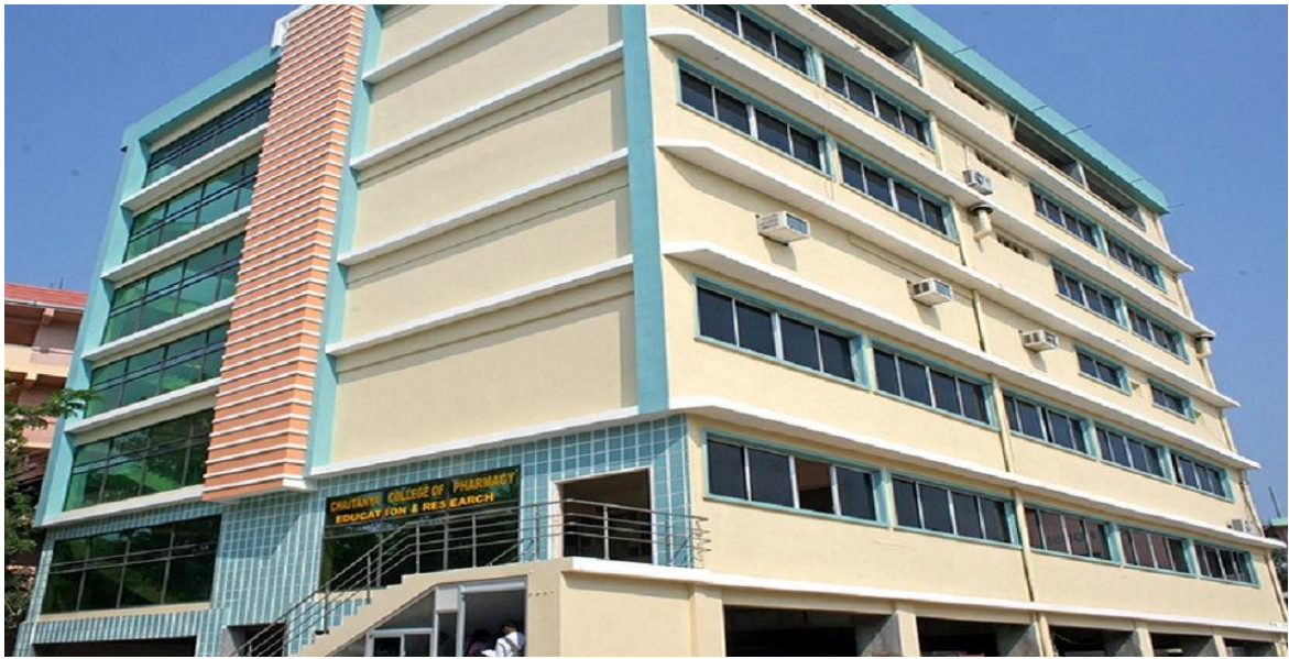
Chaitanya College of Pharmacy Education & Research, Hanamkonda, Warangal