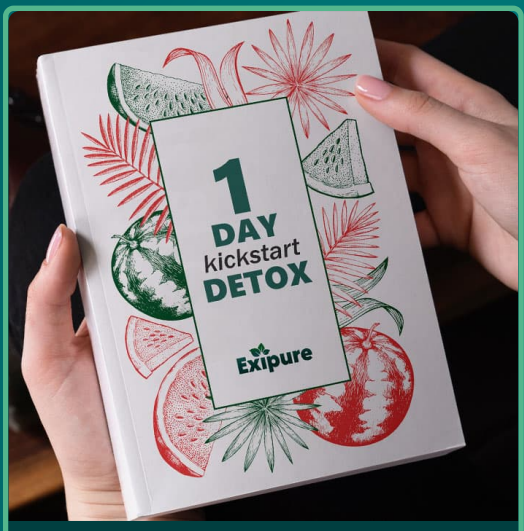
BONUS #1 1-Day Kickstart Detox