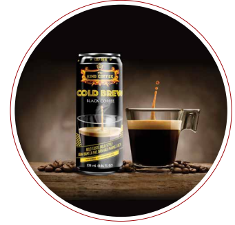
ESPRESSO COLD BREW

"Sai Gon (the ancient name of Ho Chi Minh City) has long been entitled the center of Vietnamese coffee culture which fresh "Ca phe sua da (Iced milk coffee)" is well-known for offering the distinctive taste that hasn't been found anywhere in the world.