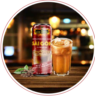
VIETNAMESE ICED MILK