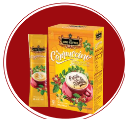
French vanilla Flavor