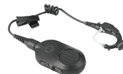
Operations Critical Wireless Earpiece

“When I first saw the MOTOTRBO SL Series I thought that it was a cell phone, not an actual two-way radio. It has all the capabilities of a two-way radio but with a professional, discreet look that fits absolutely well with all our uniforms.”