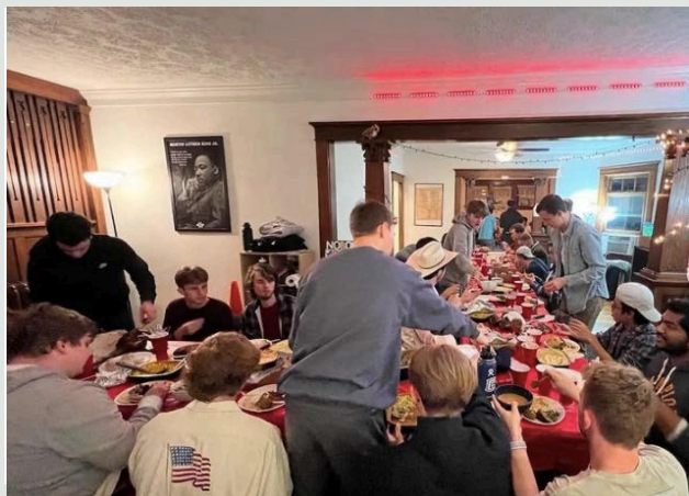
Pictured: Brothers eating Thanksgiving dinner around the table at the Sandecastle satellite house