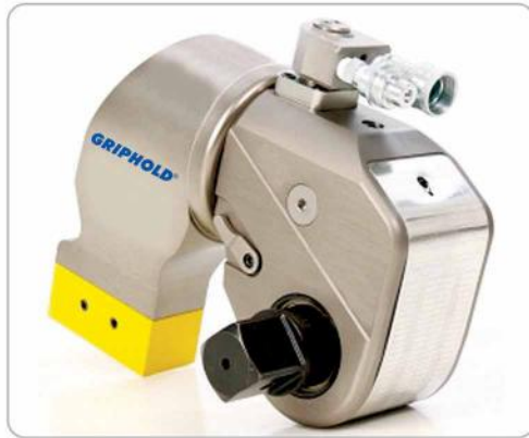
Square Drive Hydraulic Torque Wrench