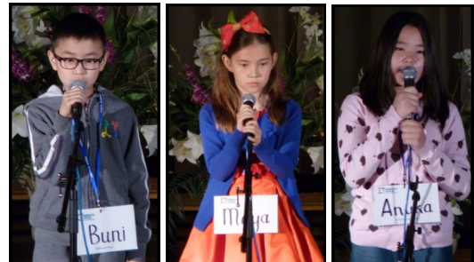
The top three finalists remain calm and composed under pressure.

ASU Elementary held a Spelling Bee in May, and it offered an intense competition pitting students from grades 2 through 5 against each other. This was the first time the event was held at ASU, and in the weeks leading up to the competition, students could be seen walking the halls with dictionaries under their arms or scanning over spelling lists in preparation. The students first competed against their classmates, then the top five from each class competed at the grade level, and the top 5 from each grade advanced to the semi-finals. The top 10 finishers, which as it turned