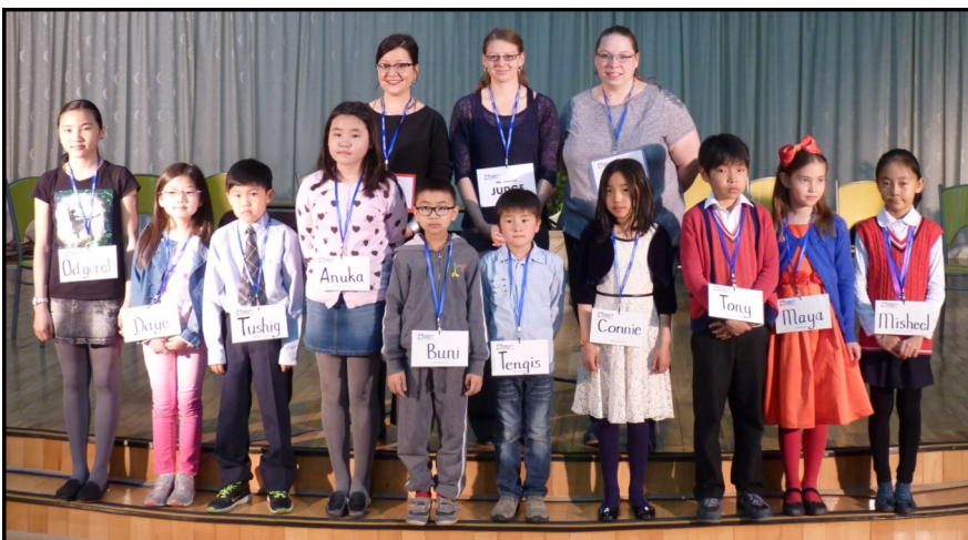
Finalists—including students from second, third, fourth and fifth grades—pose with the judges.

out included students from each grade, competed in the finals during the last week of May. In the end, difficulties with the words histrionics and meringue eventually resulted in students placing third and second, respectively, but everyone who participated showed professionalism and composure as they stepped up to the microphone.