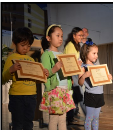
Pre-K awardees at the year-end assembly.