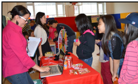
(Above left) Wheel of Fortune with a spelling challenge and