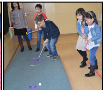
(above right) miniature golf during the Open House.