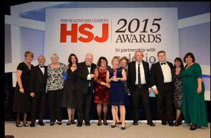
HSJ Award Winners