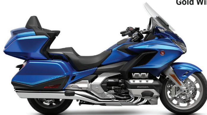
Gold Wing Tour Airbag DCT