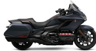
Gold Wing Automatic DCT