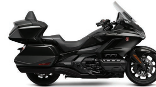
Gold Wing Tour