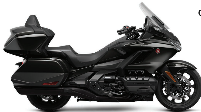
Gold Wing Tour Gold Wing Tour DCT