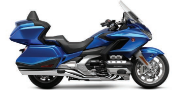
Gold Wing Tour Automatic DCT