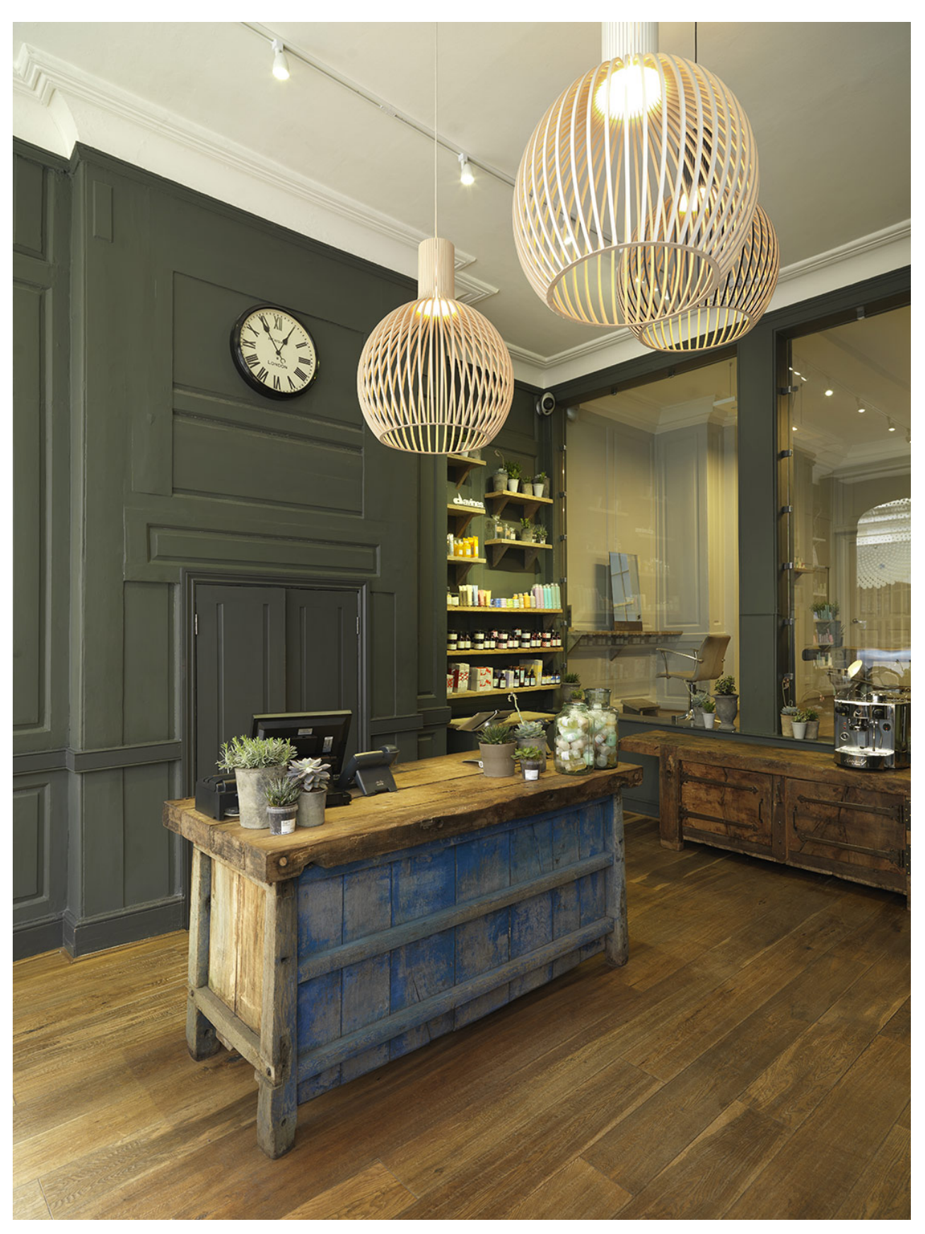
The Hairform! Yes, this is the location where you will get whatever that you need regarding your hair. You will get a professional's service on hair cut and hair color with the discount

movement, how can I forget about the hair color? I need to say, people are simply freaking over this style. They like it horribly. People want to color their hair to look more fashion star. Whereas, it seems helpful for them too. As lots of people will react to hair treatment, hair cut, hair styling, and hair pigmentations, you should know about the very best beauty parlor in Singapore.