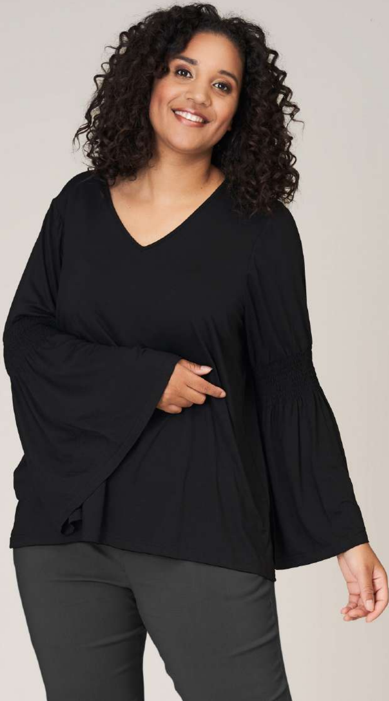
BLUSE 499 95