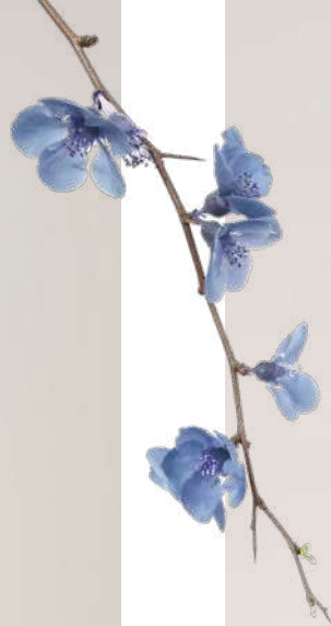
CARDIGAN 599 95