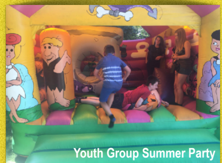
Youth Group Summer Party