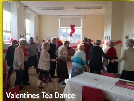
Valentines Tea Dance

Within this booklet you will hopefully find out more about us as a church, the different services we have, our work with children and young people, links with the community and the variety of events we hold.