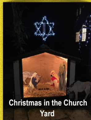
Christmas in the Church Yard