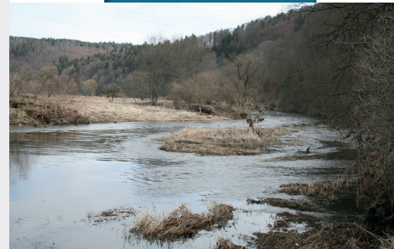
Danube downdwelling site

The Danube river is the 2nd largest river in Europe, flowing through ten countries, as many as no other river in the world. The Danube river has its main source as small mountainous stream (Brigach) in the Black Forest Nature Park, taking up the stream Breg and the Danube spring in Donaueschingen, where the Danube is born. Flowing through a karst region the Danube percolates through chasms in the karst rock and “disappears” completely from the surface during ca. 150 days/y. The water emerges as Germanys largest spring, Aachtopf, which then flows as Radolfzeller Aach into Lake Constance.