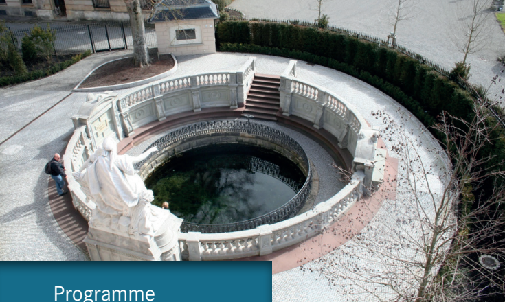
Oder Donauquelle