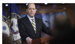
House Staff Under Scrutiny as Trading