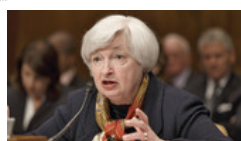
Fed Rate Debate Focuses on Jobless