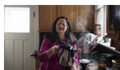
Expats Break Up With Uncle Sam