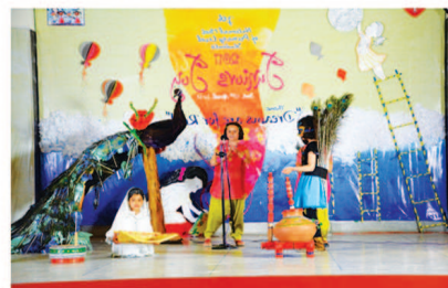
Students Quality Circles: An Initiative of Modernage to Develop Quality Mindset

They prepare a case study of their selected problem and share it with their school fellows. They not only improve their presentation skills but also ignite their creativity. Their language skills also develop. Most of all they realize their roles as responsible citizens. In Nov 2017, the United Nations-ESCAP Thailand recognized the Students Quality Circles initiative of Modernage as Best Practice for Youth Empowerment. Every year since 2008, EQUIP-Pakistan has been holding regional as well as national conventions in Pakistan. Each Convention has been a success owing to the enthusiasm of students, teachers, academicians, educationists and scholars whose participation from national and international arena made each event a truly memorable one.