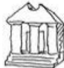
THE RESEARCH LIBRARY