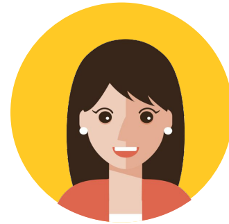
Lucky KYC.Crypto User