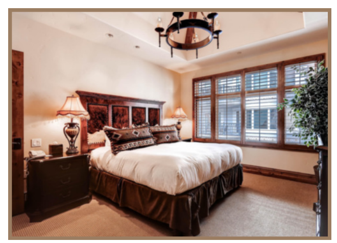
Resort-level furnishing and finishes.