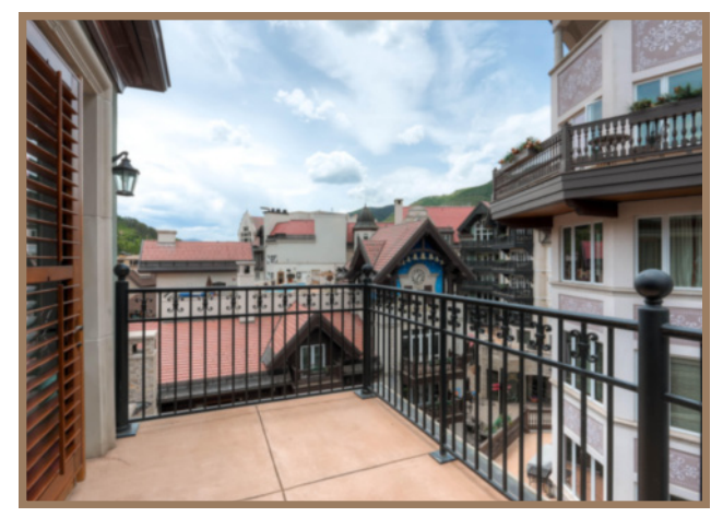
Balcony overlooking Vail Square.