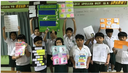
Language Arts Activity by Grade 3