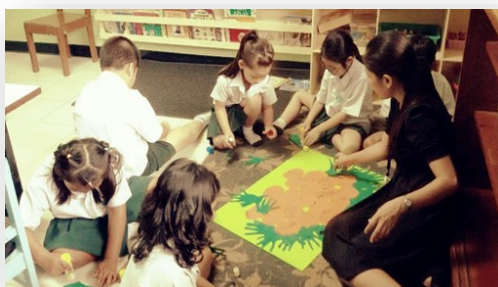
Teacher’s Day Activity by Grade 1