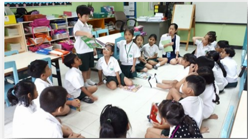
Language Arts Activity by Grade 1