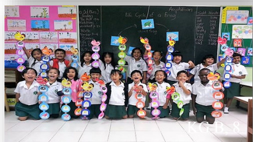
KG B, 8