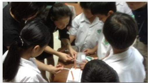
Science Activity by Grade 4