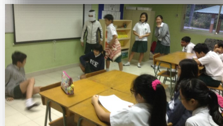
Learning through games is fun in Grade 6 classroom