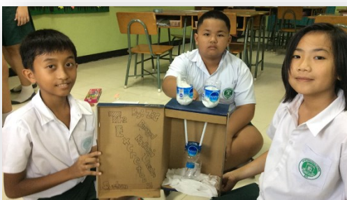
Science Activity by Grade 5