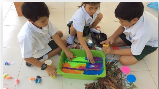
Science Activity by Grade 2