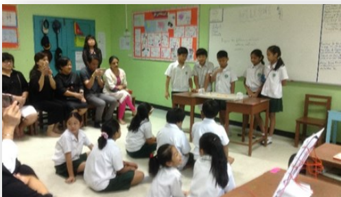
Science Activity by Grade 4