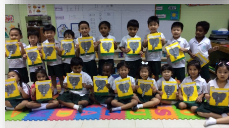
PreK 2 Classroom Activities