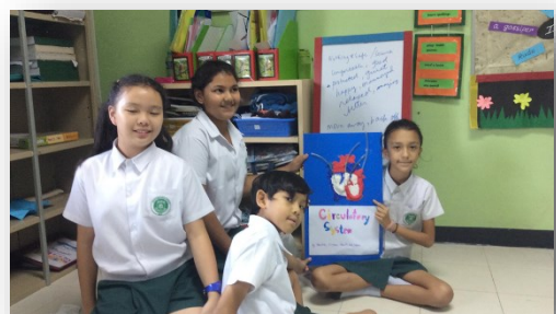
Science Activity by Grade 5