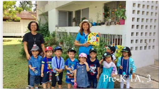
Pre-K 1A, 3

In the picture, the Dynamic Dolphins students are all smiles as they proudly present their output for their lesson in Science, the Life Cycle of the Hen. (See picture 8)