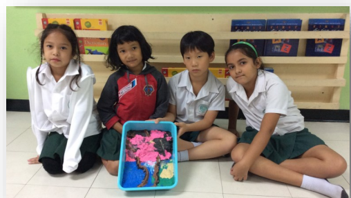
Science Activity by Grade 2