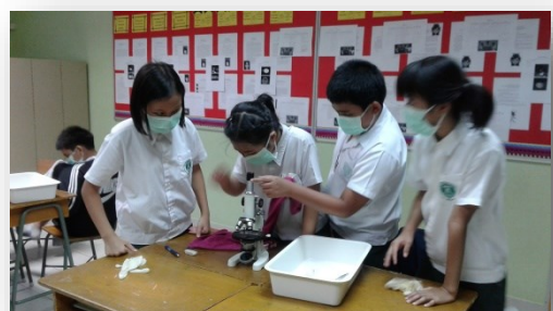
Science Activity by Grade 6