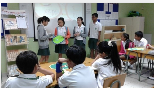
Science Activity by Grade 6