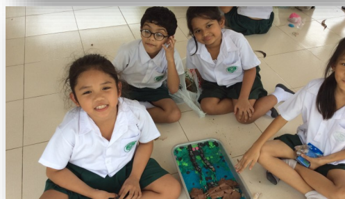
Science Activity by Grade 2