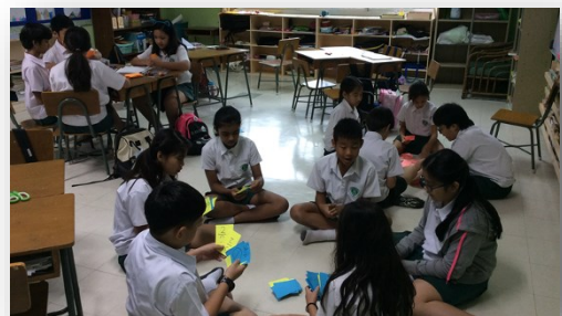
Math Activity by Grade 5