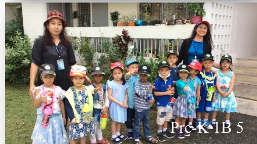
Pre-K 1B 5