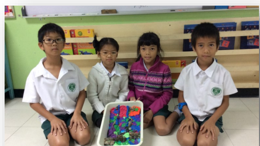
Science Activity by Grade 2