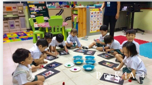
Pre-K 1A, 4