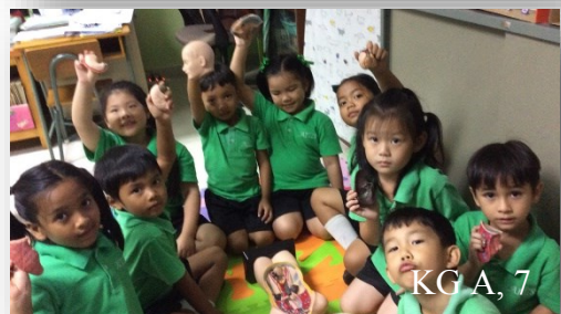
KG A, 7