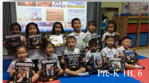
Pre-K 1B, 6