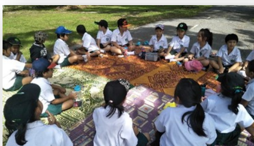
Language Arts Activity by Grade 1