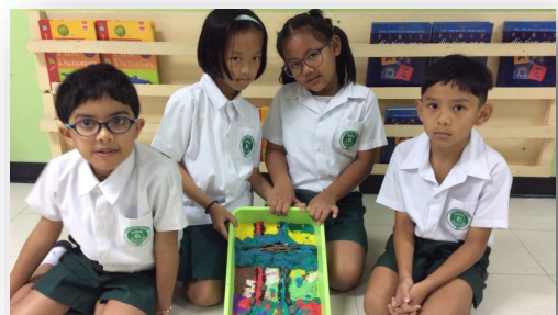
Science Activity by Grade 2