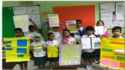
Language Arts Activity by Grade 3