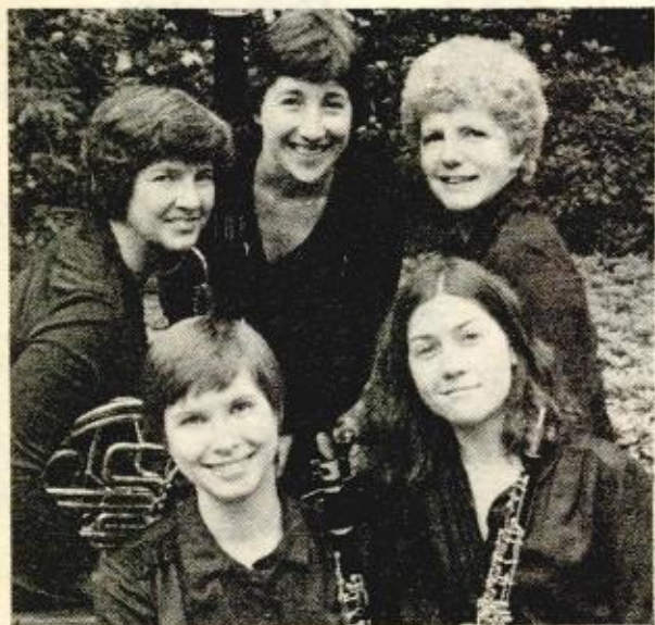
CANTILENA WIND QUINTET

The highly acclaimed Cantilena Wind Quintet will perform a concert of chamber music on Friday evening, April 27, beginning at 7:30 p.m. at the Charlestown Community Center, 14 Green Street.