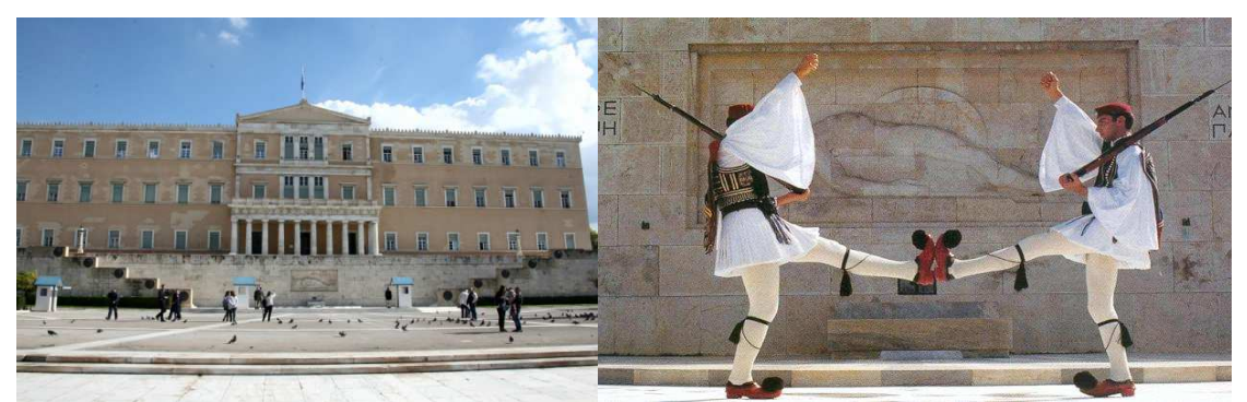
monument all day in their beautiful traditional costumes worn during the Greek revolution of 1821 against the Ottoman Empire.

DAY 2. ATHENS CITY TOUR : Breakfast in the hotel and departure for the Athens city tour. We bring you to see the Parliament, a beautiful building in the heart of the City and the Monument of the Unknown Soldier below. Troops of the Presidential army, are guarding the