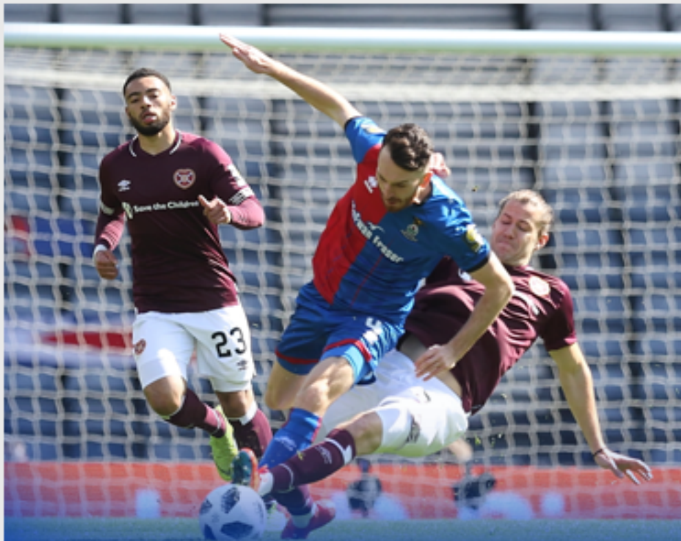
CHALMERS HAD A TOUGH TASK IN MIDFIELD

Three Second-half goals for Hearts earnt the Edinburgh side a place in the Scottish Cup Final, as they beat Inverness Caley Thistle 3-0 at Hampden Park.