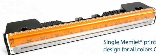
Single Memjet® printhead design for all colors CMYK

Seamlessly merge designs and layouts with text, images, barcodes and database information to handle the needs of security packaging, tracking, personalization and micro-segmentation.