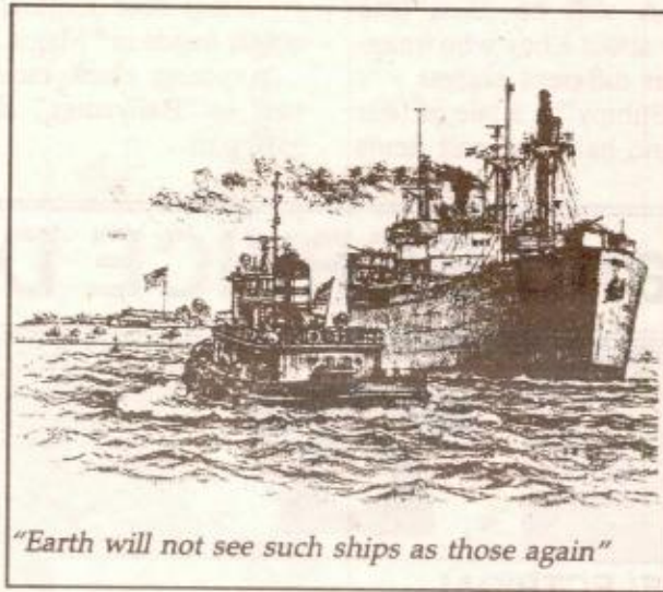
"Earth will not see such ships as those again"

A rare opportunity to sail aboard the John W. Brown is offered on Satur-