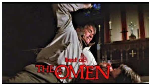
Damien's father tries to kill him

With the exception of The Exorcist based on a book Possession , The Omen is in a distinct class from other films which obliquely look to the innocence of childhood and the veneration and the vulnerability of Christ as a child, and pervert these. The Omen is sophisticated with its confluence of politics, business, and internationalism, its cynical use of Christian themes and its concern for the “seed of Satan,” a direct “counterpoint” to Christ. Through a series of mishaps, Robert Thorn as Damien's father learns his child is the son of a jackal and Satan. As Thorn attempts to murder Damien, Abraham's sacrifice of Isaac is warped with the rich tradition of Hollywood's vampire lore. Like Herod, Sam Neil as Damien in the Omen III has his henchmen kill children born on a day prophesied to be Christ's second coming. Damien is confirmed as Satan from the 666 his scalp bears, his invincibility to physical injury, and the wall called “Yigael's Wall” with his likeness on it in. Supernatural forces, Rotweiller dogs, wicked nurse maids, and people with hidden allegiances for the Antichrist clear Damien's path to attain higher office in later installments of The Omen franchise.