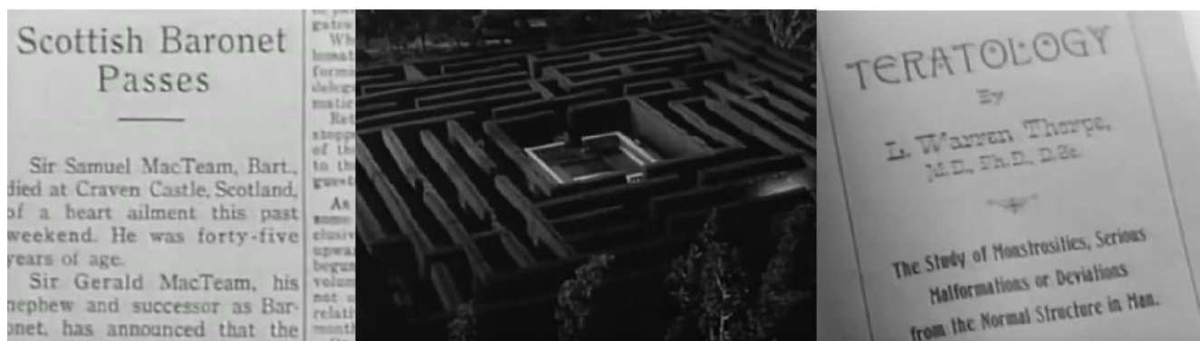
From the 1953 film The Maze which has a frog as the lord of the castle

James' short story, “The Haunted Doll House” too has a doll house purchased from an antique shop take on “magical” or mystical “energies.” “Quintessence of Horace Walpole, that's what it is: he must have had something to do with the making of it.” Such was Mr. Dillet's reflection as he knelt before it in reverent ecstasy.” iii Like The Shining , and Amityville Horror , and those strewn through out The Omen , James' story has as its basis family murder, though this time by a frog “the size of man” with white hair.