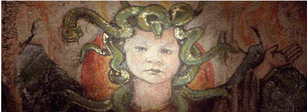
Yigaels Wall from The Omen

Take a child. Imbue the child with satanic powers. Add priests, crucifixes, inexplicable disasters, allusion to Biblical prophecies and set this in a country with a intense sense of Christian ethic, however residual among those with lapsed faith. Situate it in an upper to upper-middle class household. This is exactly what the producers of The Omen did. Other films use this strategy. In The Bad Seed , a girl, Rhoda Penmark murders without compunction. After she kills several characters, Rhoda's grand-father exposes her heritage: she is not his grand daughter but a serial killer's grand daughter. Rhoda confesses to killing old ladies for trinkets, a classmate for a penmanship meddle, and to tampering with evidence connected to a murder.