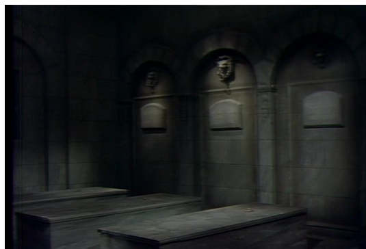
The Collins Stoddard Mausoleum from Dark Shadows

In a third, among trees, was a man running at full speed, with flying hair and outstretched hands. After him followed a strange form; it would be hard to say whether the artist had intended it for a man, and was unable to give the requisite similitude, or whether it was intentionally made as monstrous as it looked. In view of the skill with which the rest of the drawing was done, Mr. Wraxall felt inclined to adopt the latter idea. The figure was unduly short, and was for the most part muffled in a hooded garment which swept the ground. The only part of the form which projected from that shelter was not shaped like any hand or arm. Mr. Wraxall compares it to the tentacle of a devil-fish, and continues: 'On seeing this, I said to myself, “This, then, which is evidently an allegorical representation of some kind – a fiend