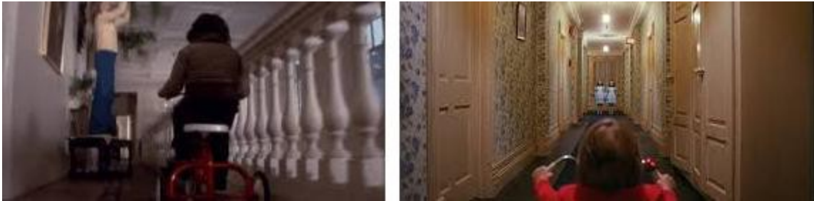
Tricycle scenes from The Omen and from The Shining

Omen . The book is named for the ability to “telepathically communicate.” Jack Nicholson as Jack Torrence is the winter caretaker at the Overlook in Colorado, site of “an ancient Indian burial ground” like the house in The Poltergeist . Like Amityville Horror , it is also the scene of a family murder. Torrence in the Omen goes insane and his death is a welcome end to a bone chilling pursuit of Danny through the hotel's snowy maze. Like Dark Shadows and The Omen , likenesses in pictures contribute to the eerie, quasi -mystical essence of the Shining . Torrence's likeness is in a “group photo” after his death.