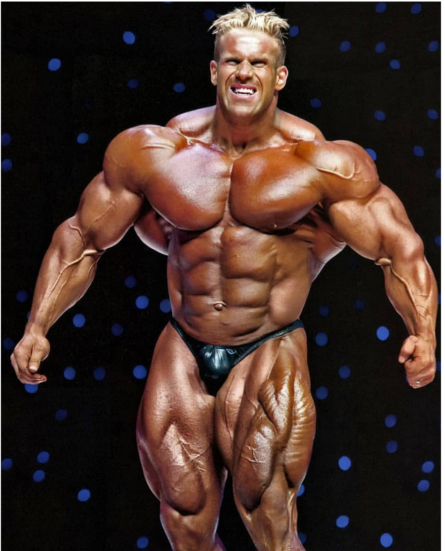
It was my first time doing total body with my new toy and it was a fun challenge. I did more exercises that i will mention.