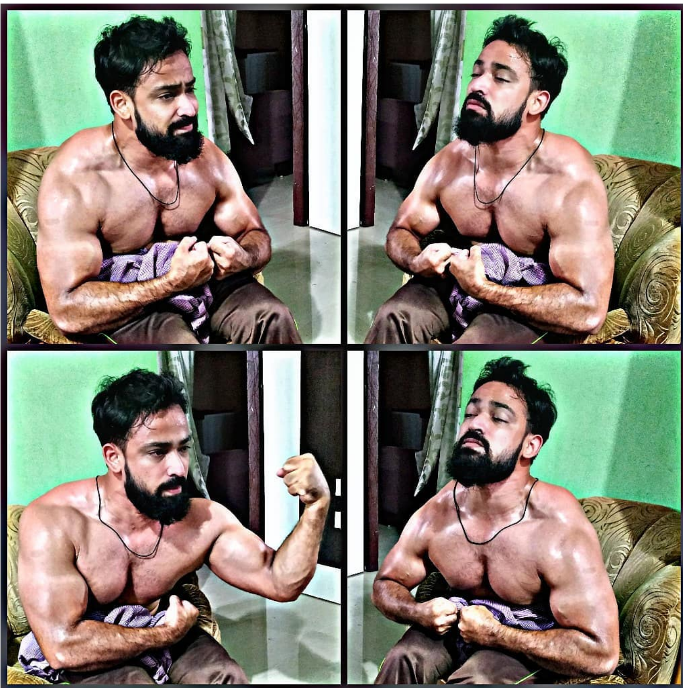
(Nandrolone Decanoate) Deca Durabolin is an extremely popular anabolic steroid comprised of the steroidal hormone Nandrolone and is attached to the large Decanoate ester. The Nandrolone hormone first appeared in 1960 and developed for commercial use in 1962 by Organon under the trade name Deca Durabolin.