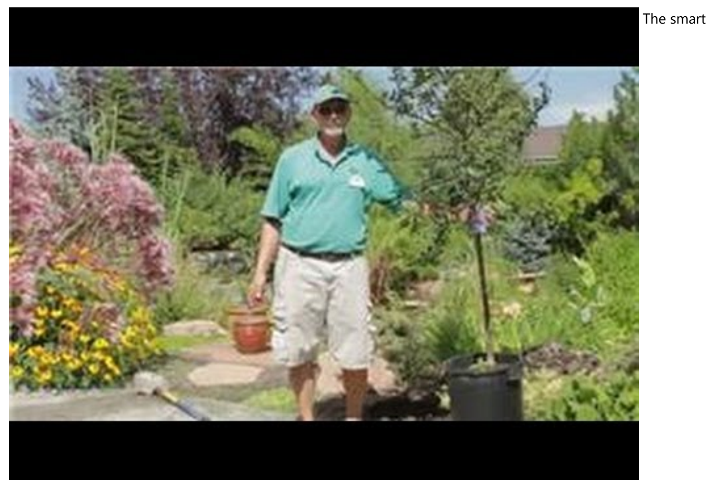
Trick of Crab Apple Trees For Sale That Nobody is Talking About

For the 1st handful of years, ensure your recently grown complainer apple tree is actually effectively sprinkled in dry periods. Always offer a mulch of well-rotted manure or compost in springtime and trim in overdue winter to eliminate any sort of dead, perishing, infected or even crossing branches. It is actually feasible to circulate complainer apple trees through taking softwood cuttings in late spring or even very early summer season.