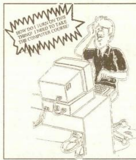
ACCORDING TO THE STAFF, THIS IS JERRY STEIMEL!

12 & Under Boys Ball Hockey - The boys team repeated as ball hockey champs