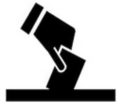
Marauding Democrats that Vote

Also immigrants, women, and those with different religious affiliations, among others.