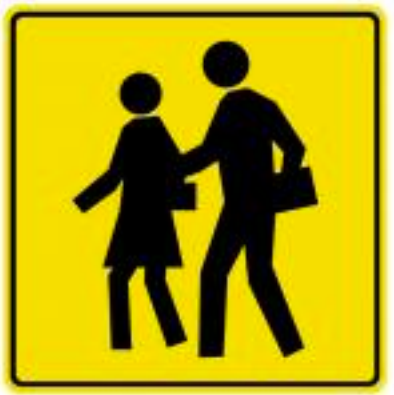
Marauding School Children