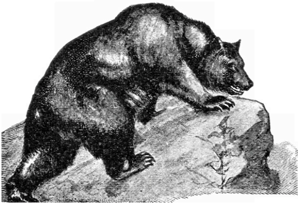
Marauding Grizzly Bears