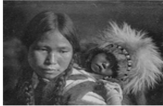
Marauding Native Americans