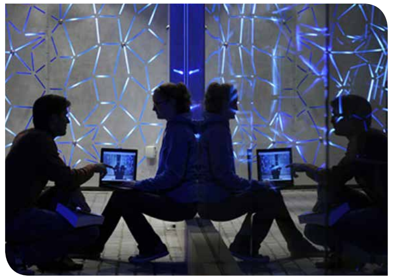
Art on Campus Collection, University Museums, Iowa State University

lowa's three public universities have raised nearly $1 million in private gifts to support Art in State Buildings projects.