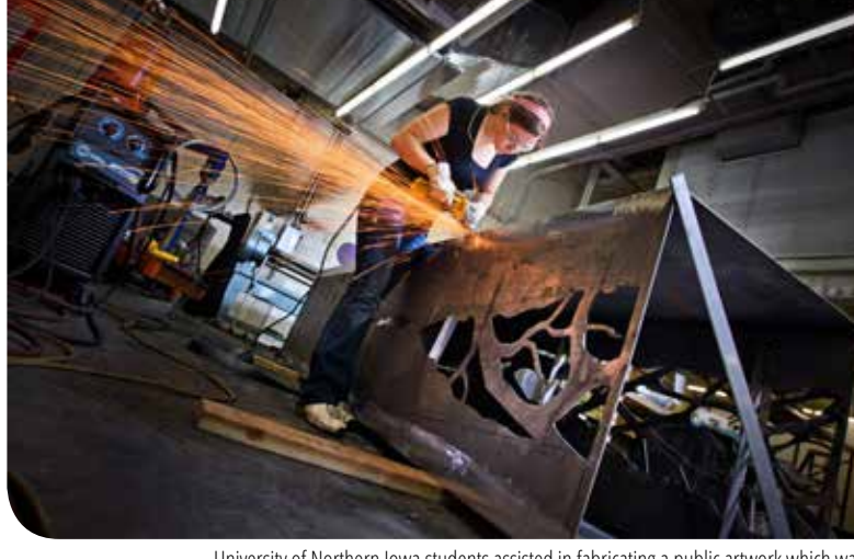
University of Northern lowa students assisted in fabricating a public artwork which was part of an Art in State Buildings project.

Public funds directed to the purchase of fine art have been greatly enhanced by private gifts, donations and commissions.