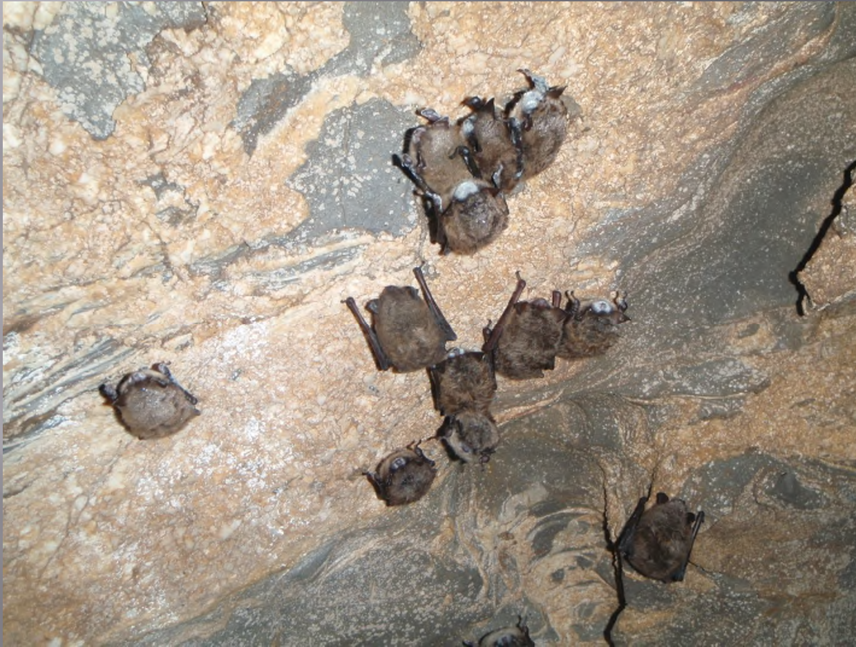
taken during winter bat count