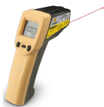
Ongoing Screening Protocol

Substantial discounts on needed equipment from major suppliers.