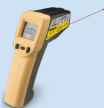
Ongoing Screening Protocol