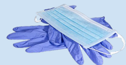
Personal Protective Equipment