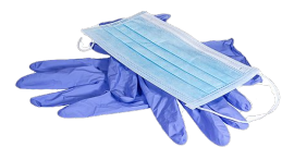
Personal Protective Equipment