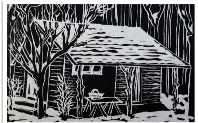
Sadie Somerville, Original Homestead

Saturday January 20, 2024 7 AM- 3:15 PM (No snow date) Buzz Ware Village Center 2119 The Highway; Arden DE $25 resident/ $35 nonresident