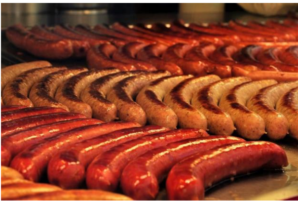
Demand for bratwurst on the increase in the Kingdom of Prussia

Prussian players have had mixed reactions to this news. Some being happy they are having a team of experienced RvR players that can help them defend ports. Others such as one anonymous source said they were concerned that they will “ruin our small community of friends”. GB will be severely weakened at the loss of one of its largest and most influential clans.