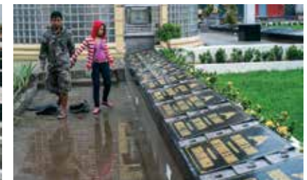
Workers on Monday paint wooden barricades that will be used to secure areas that will be visited by Pope Francis in Tacloban City and Palo town in Leyte on Jan. 17. (left) ; A couple walks through a mass grave of Typhoon Yolanda victims outside the Palo Cathedral which Pope Francis will visit on Jan. 17 for his private prayers. (right)