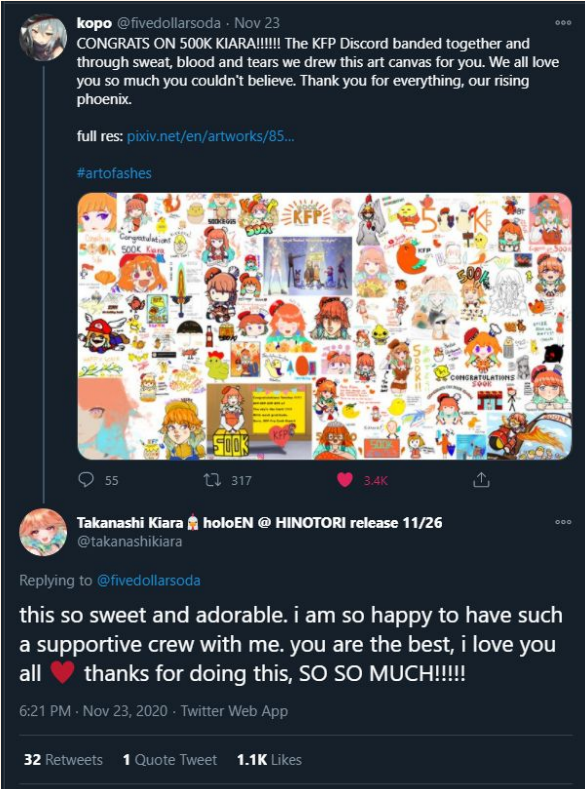
Above: Kopo shares the 500k art canvas on Twitter