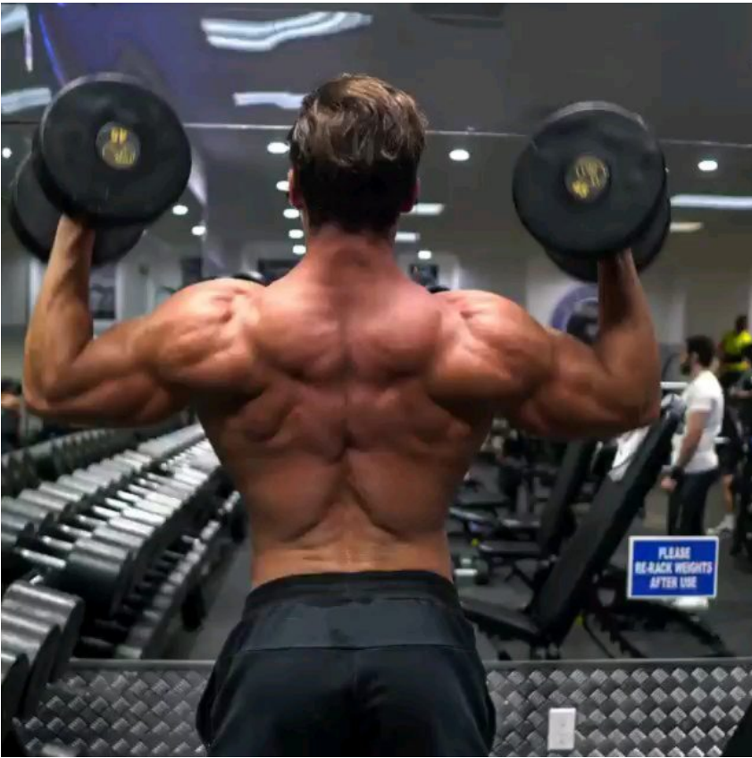
#photooftheday #fitness #gym #workout #fit #fitnessmotivation #motivation #bodybuilding #training #health #fitfam #lifestyle #love #sport #instagood #healthy #healthylifestyle #crossfit #gymlife #personaltrainer #exercise #onlyfan #weightloss #fitnessmodel #gymmotivation #follow #yoga #like #fitnessgirl #instagram