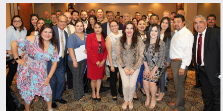
Pharr EDC and Greater Pharr Chamber of Commerce staff network with business and community partners.

In the month of April, the Pharr EDC and the Greater Pharr Chamber of Commerce hosted a Social Mixer at the Hampton Inn & Suites Pharr to continue promoting the local lodging industry as well as offer networking opportunities for our business community and entrepreneurs in the region.