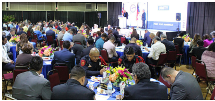
Guests unite in prayer at the Pharr Events Center during the city's 2018 National Day of Prayer.