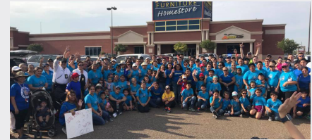
Walk of Faith - Pharr community members came together in unity for the Walk of Faith for the National Day of Prayer.

Following the National Day of prayer celebration, City of Pharr community members and city leaders gathered in the evening for the annual "Walk of Faith". This yearly event brings families, youth, and community together in the spirit of UNITY with prayer and hymns.