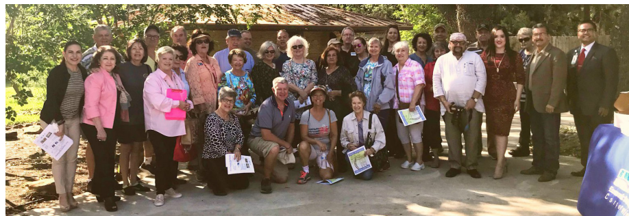
Texas Tropical Trail Region guests pictured at the Greater Pharr Chamber of Commerce after a breakfast welcome reception.