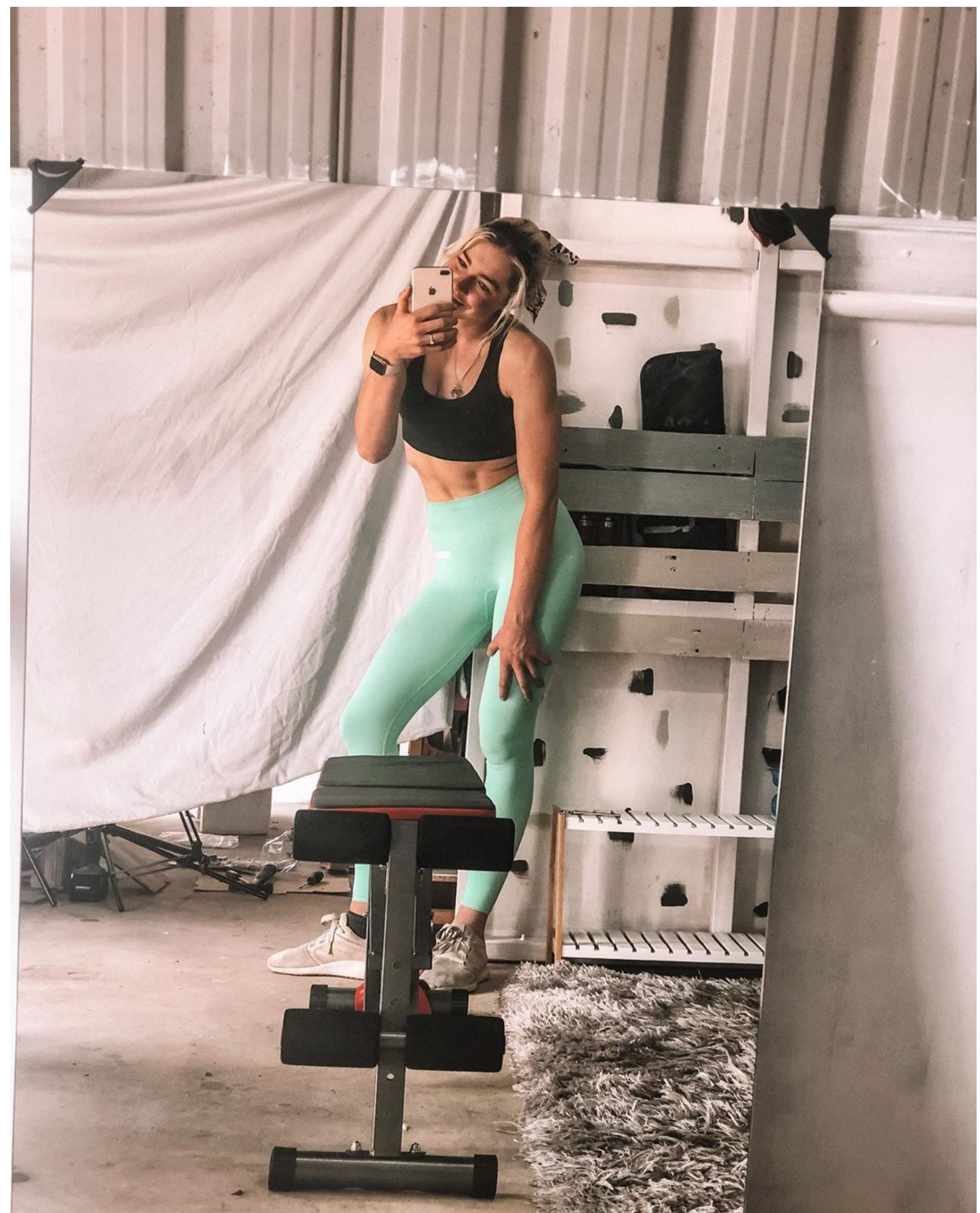
When you look at the exercise it pretty much mimics you getting up out of bed or getting up from laying on the floor. Which is why it's called the get-up. But if we do that every day then why would an exercise of it be so effective.

\underline{https://github.com/konstantin5bkas/lasto/wiki/Order-Clenbuterol-HCL-40-mcg--Hilma-Biocare-UK-50-tabs}