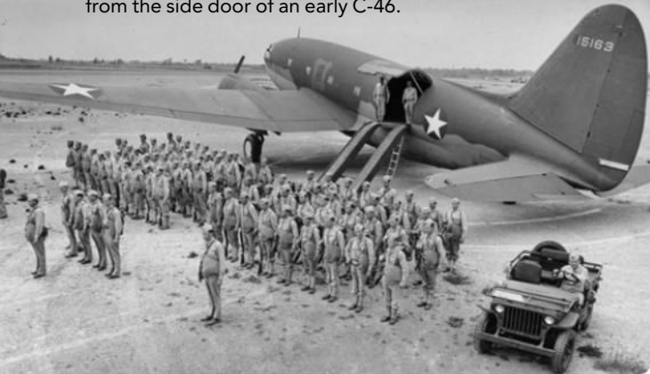
CAVERNOUS HOLD U.S. Army troops form up after disembarking from the side door of an early C-46.

The CW-20 prototype had a long aluminum fairing to hide the crease between cabin and baggage compartment, but the extra