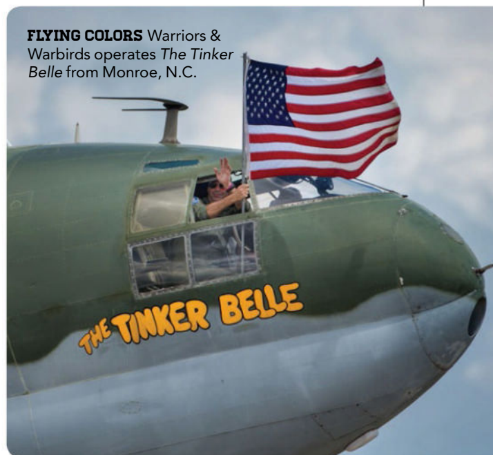
FLYING COLORS Warriors & Warbirds operates The Tinker Belle from Monroe, N.C.