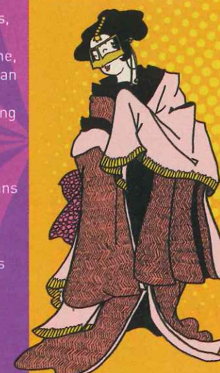
Khalid Mezaina, Maiden, 2016

East-East: UAE Meets Japan runs until 31st October at NYUAD Arts Centre, Saadiyat Island. Free. To find out more, visit: nyuad.nyu.edu