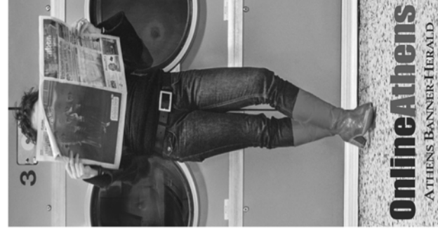
OnlineAthens A THEANS BANNER-HERALD