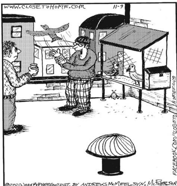
"Voting by homing pigeon is much easier, plus I don't trust voting machines."