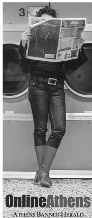
OnlineAthens ATHENS BANNER-HERALD