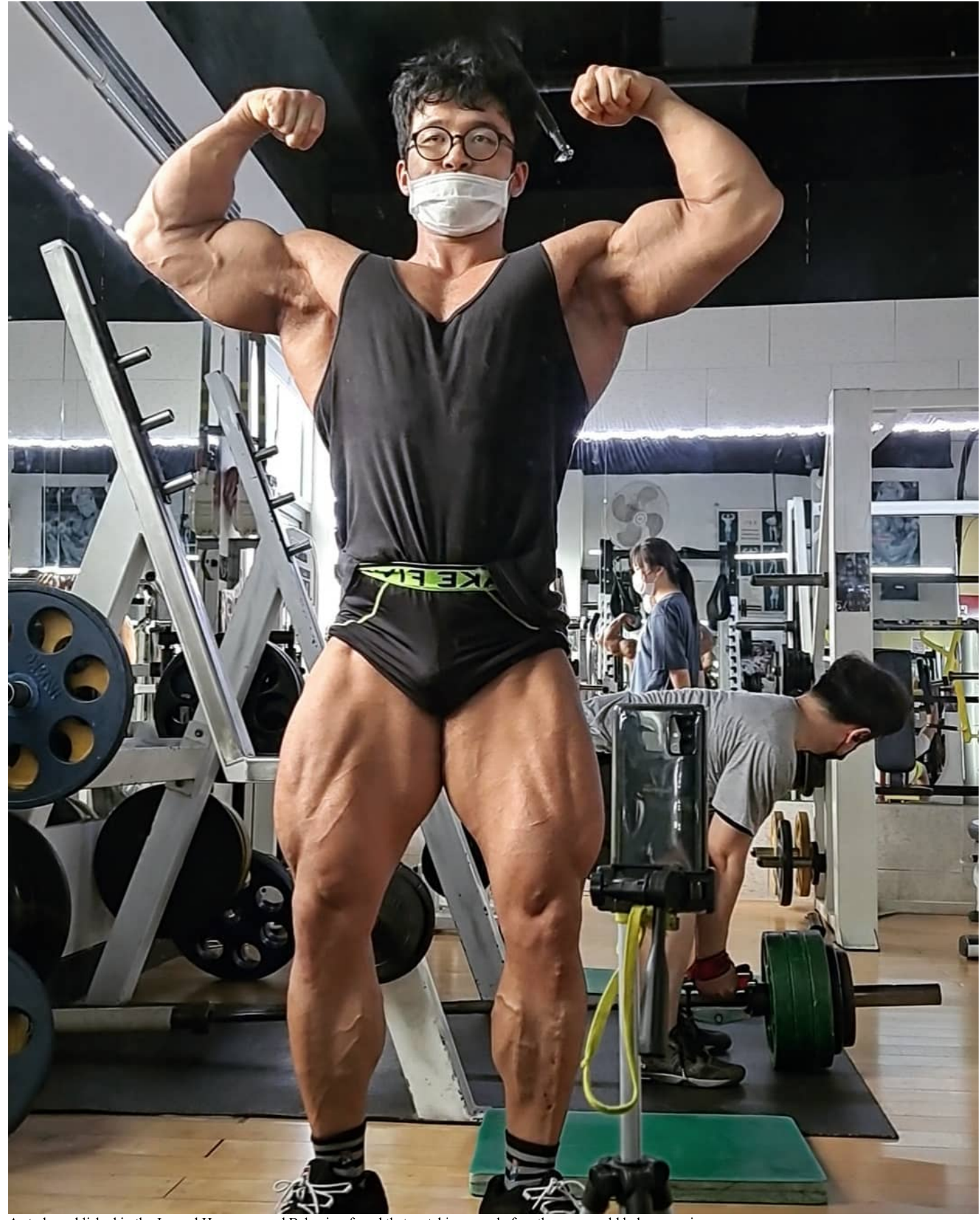
A study, published in the Journal Harmones and Behavior, found that watching porn before the gym could help you gains.

\underline{https://www.pinterest.com/pin/652318327268314062}