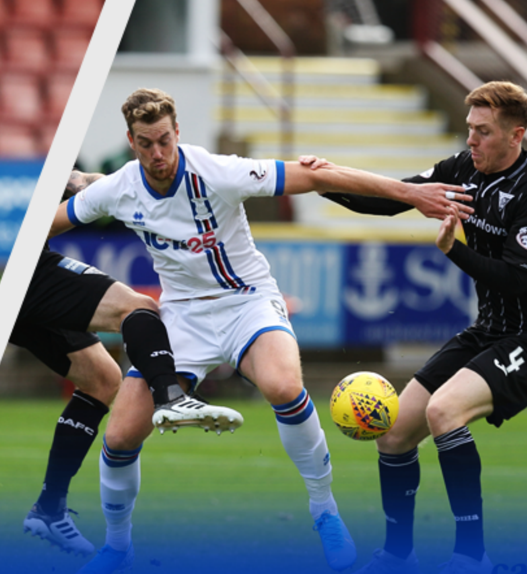
WELSH SMASHES HOME THE WINNING PENALTY & WHITE MUSCLES HIS WAY TO THE BALL