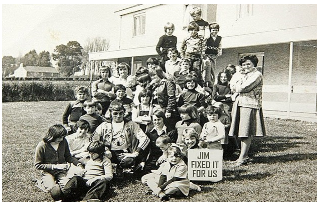
Jimmy Savile pictured with 30 children from the Haut de la Garrene Home