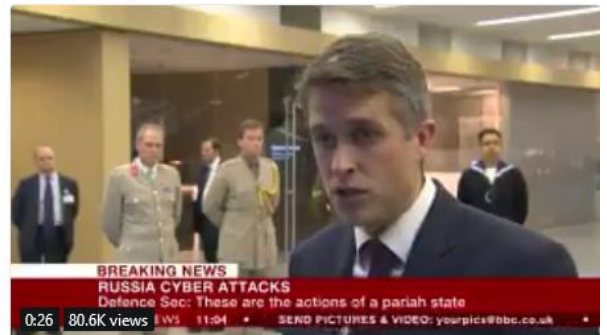
Gavin Williamson MP, Defence Secretary